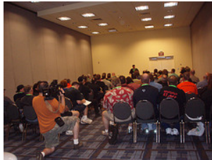
MHC Weekend Seminar Sessions

June Training Classes to Serve Haunted Attraction Industry Professionals and Enthusiasts